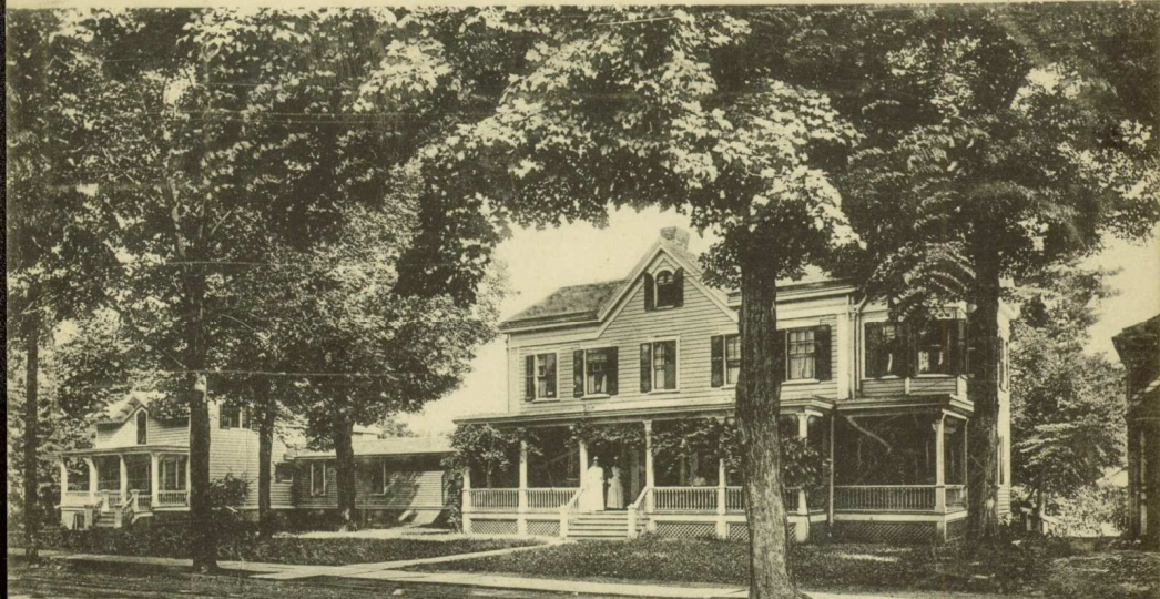
The Thompson Home & Hospital, Rhinebeck, N.Y.