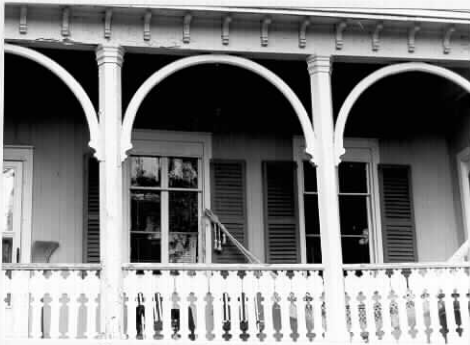
2. Front porch detail