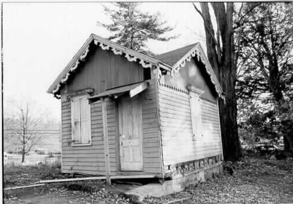
6. Law office, north facade and west elevation