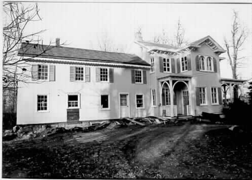
4 South Elevation