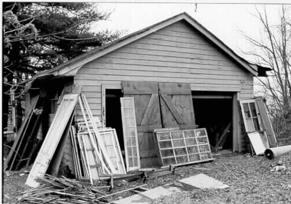
5 Garage, southeast elevations