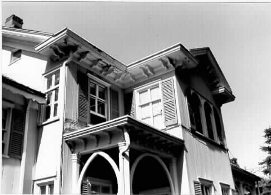
3. Rear porch and cornice detail