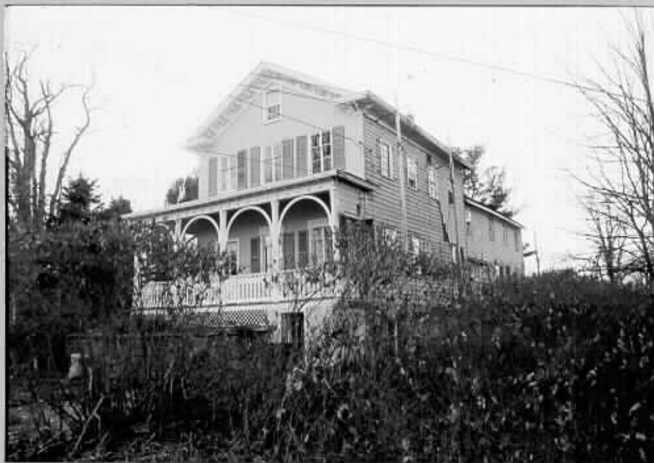
1 East (front) and north elevations